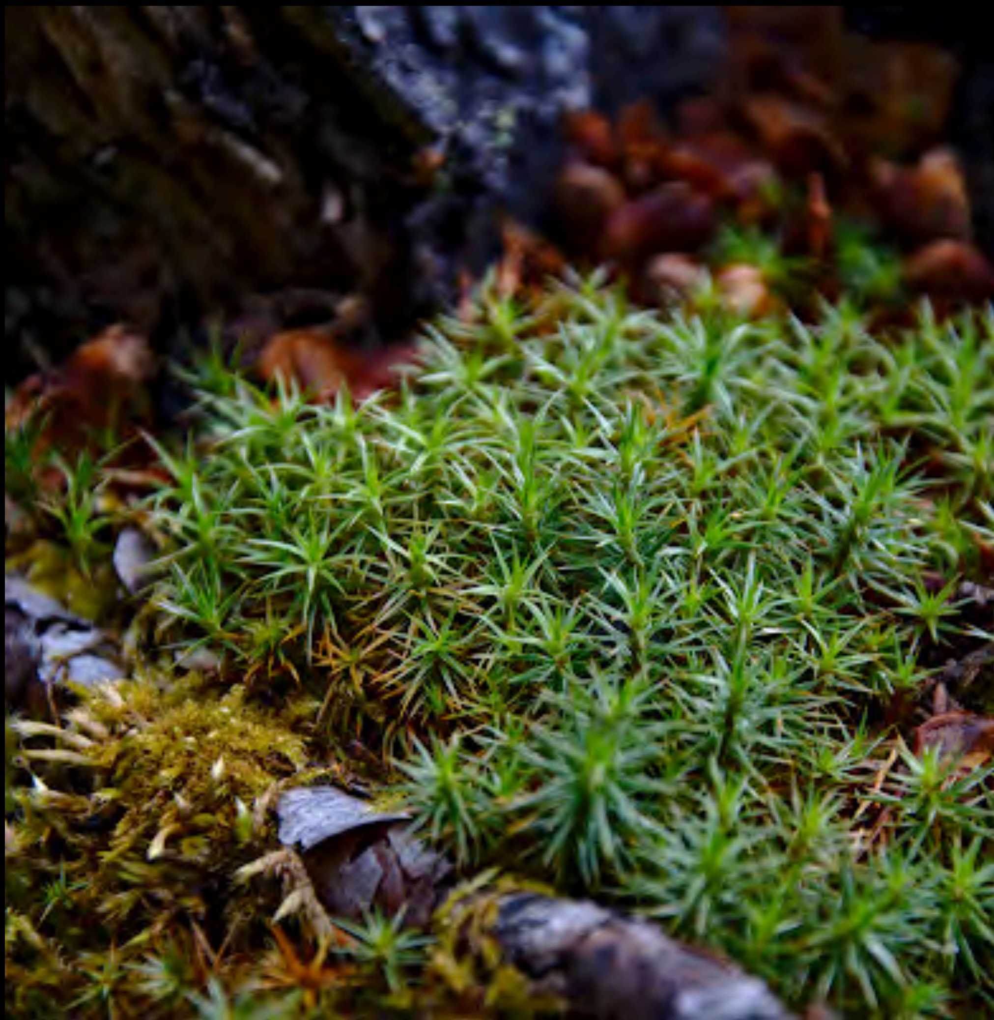
Polytrichum moss. Sometimes called “Goldilocks” or “Haircap Moss”.