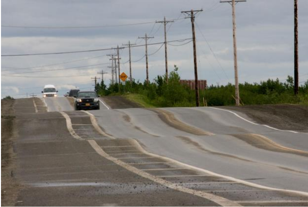
Fig. 2 Road damage in Bethel, Alaska, caused by thawing permafrost.

widespread damage or failure of the infrastructure (Fig. 2). This will make building and maintaining infrastructure on permafrost much more costly and difficult. Annual damages to roads in Alaska alone are estimated to sum up to 118 million USD annually by 2050 with increasing costs each year thereafter.