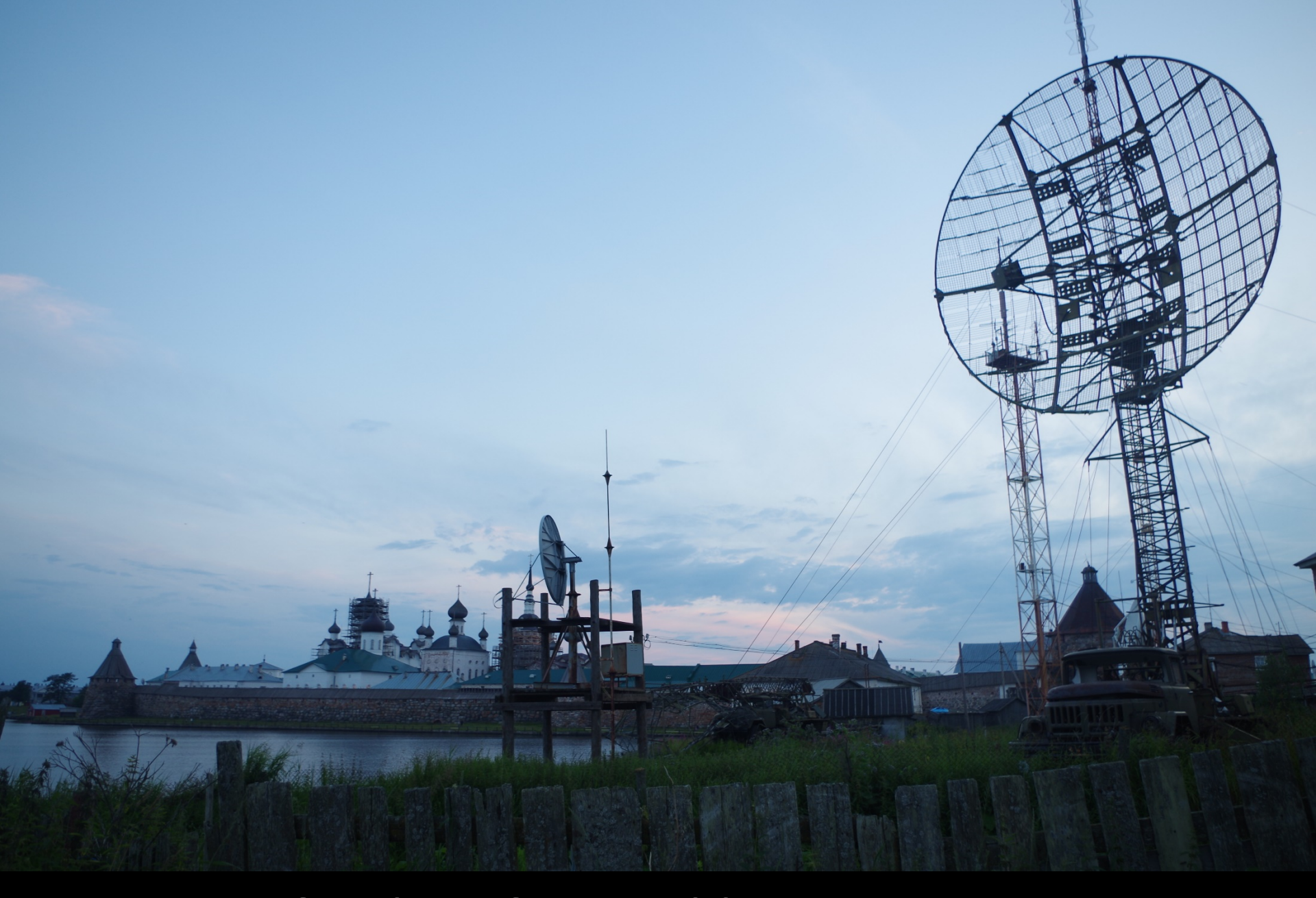
FIELD NOTES FROM RUSSIA