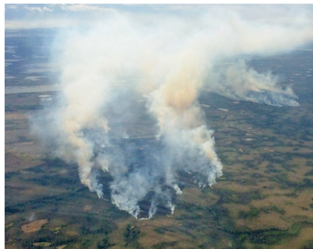
June 2015 White Fish Lakes fire in the Yukon Delta National Wildlife Refuge in southwest Alaska.

Carbon emissions from thawing arctic permafrost will become substantial within decades, likely exceeding current emissions from fossil fuel combustion in the United States. This will greatly complicate efforts to keep global warming below 2°C and adds urgency to limiting anthropogenic emissions. Unlike fossil fuel emissions, emissions from thawing permafrost build on themselves, because the warming they cause leads to even greater emissions. For this reason, emissions from permafrost could lead to out-of-control global warming.